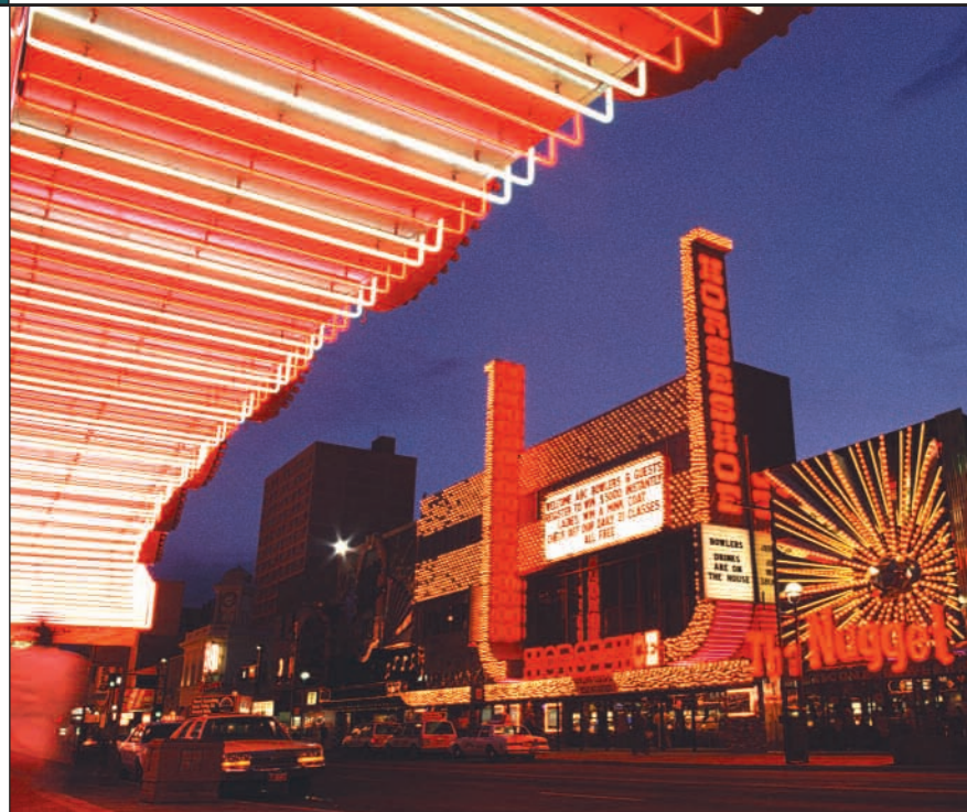
The famed Horseshoe Casino in downtown Las Vegas