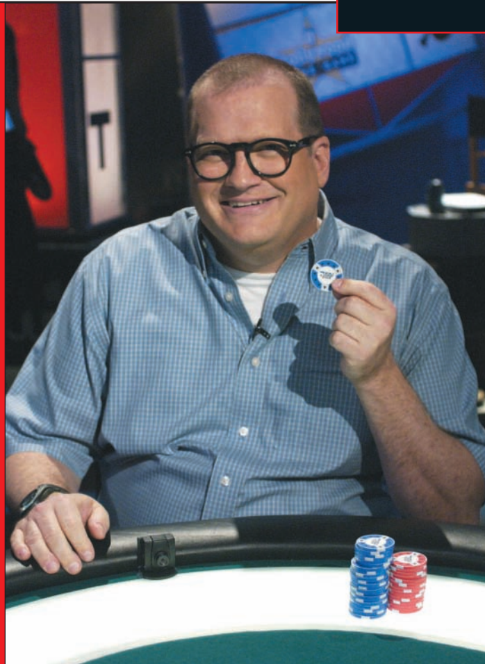
Drew Carey plays celebrity poker